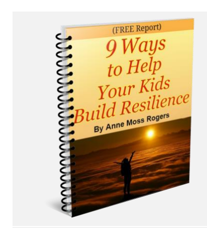
9 Things you can do to Help Kids Learn Coping Skills for Resilience