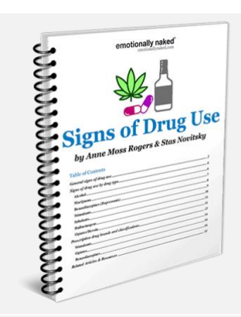
Signs of Drug Use Report