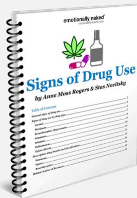
Signs of Drug Use Report