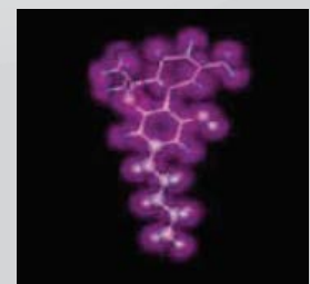
DRUG - THC